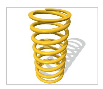
High Quality Steel Spring