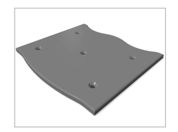
Smooth Polydek Seat

Designed to British & European Standard BS EN 1176