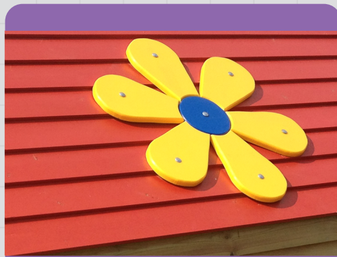
Themed Roof Example